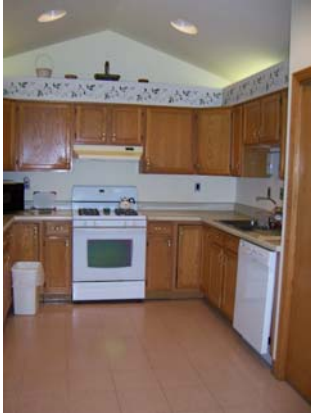
Common kitchen area