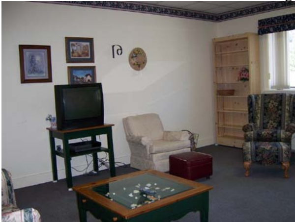
Common television cable and entertainment area