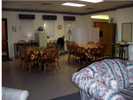
Common dining area and bathing facilities