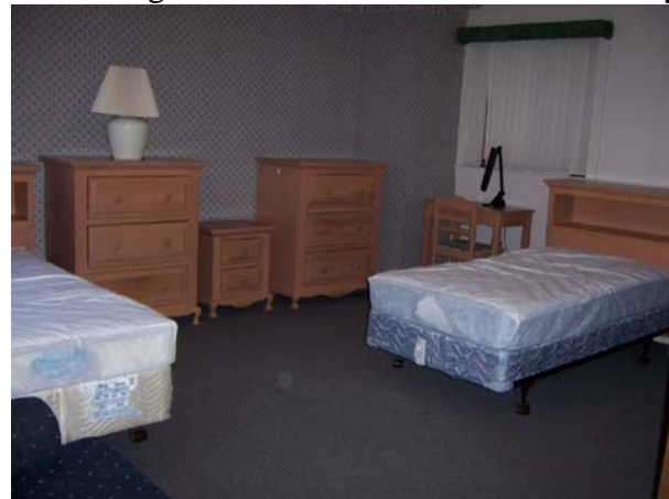
Private individual bedroom units contain half baths