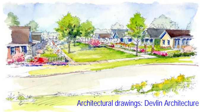
Architectural drawings: Devlin Architecture

of prices targeted to different incomes of buyers. The county will transfer land to a nonprofit land trust that will hold title to the land and provide land lease agreements with buyers. The cost of the land is removed from the price of the house, making the home affordable to low- and moderate-income purchasers. Revenue from the sales of homes will go to the Trust to rehabilitate or develop housing in other parts of the